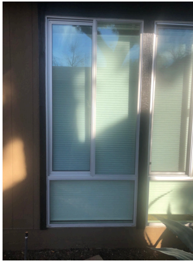
Example of compliant aluminum finish vinyl replacement Window