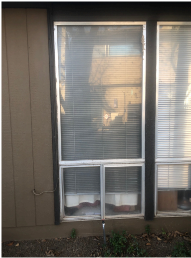
Example of existing window